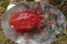
A highly magnified mite. They are actually smaller than 1mm.

Treatment and Prevention Products are available to deal with harvest mites and our vet will provide instructions for treating and helping to prevent or reduce reinfestation. During the season regularly check around the ears, face, under the chin, the mouth and areas of the body that have no or very little hair. If you see your pet excessively scratching and nibbling or notice clusters of tiny orange/red flecks on the skin, call us for further advice. There are many conditions that can cause skin irritation, so it is always best for your pet to be checked over.